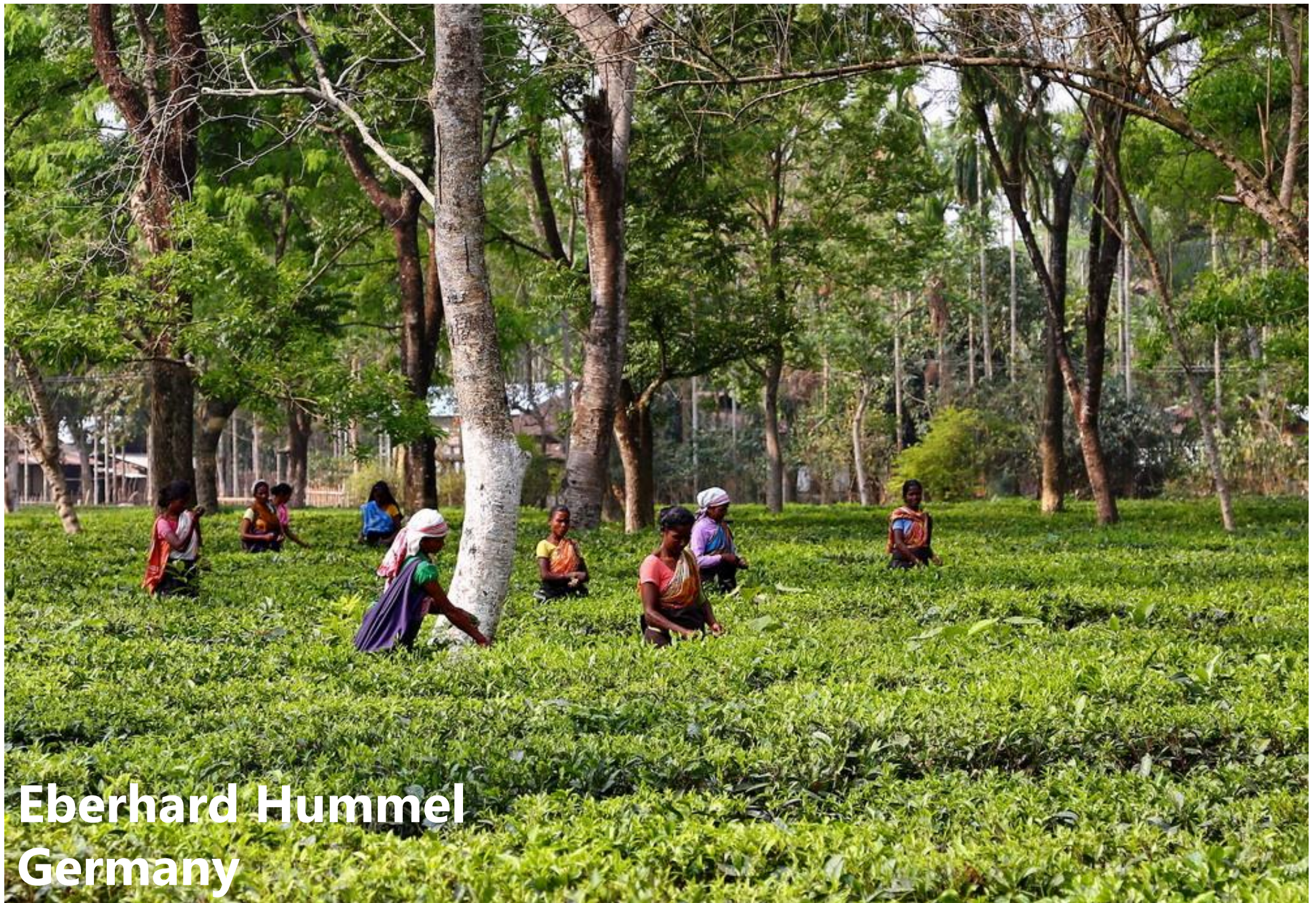
Eberhard Hummel Germany