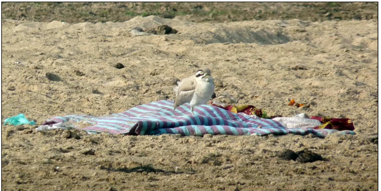
The Maharaja of thick-knees on his favourite blanket, Chambal River