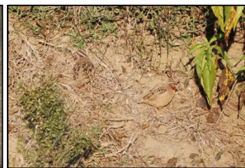
Jungle Bush-quail, Chambal