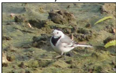
Ssp. baicalensis . Chambal

A few records not specified to subspecies: 31/12 4 Agra, 3/1 2 Chambal river (up-stream), 4/1 10 drive Gwalior to Khajuraho, 16-18/1 + Chambal.