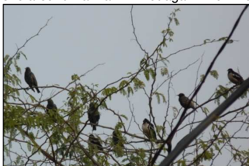
Common & Pied Starlings