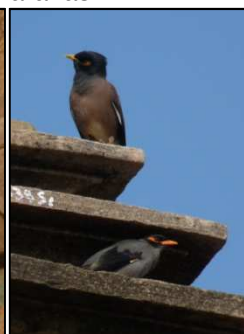
The two city-mynas