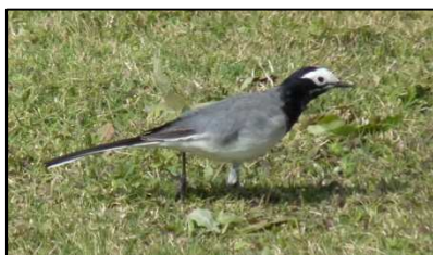
Ssp. personata . Khajuraho