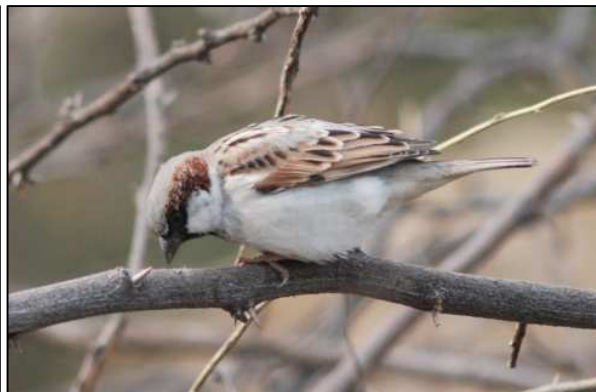
Ssp. indicus - smaller - dark bill

271. *Chestnut-shouldered Petronia Petronia xanthocillis . 1/1 3 farmland SE of Chambal Safari Lodge, 50 farmland S of Chambal Safari Lodge, 5/1 200+ Khajuraho (around temples outside village), 6/1 10 Panna Tiger Reserve, 11/1 10+ drive Jabalpur to Royal Tiger Resort, 17/1 10+ Chambal Safari Lodge, 27/1 1 Flooded fields outside Sultanpur Jheel.