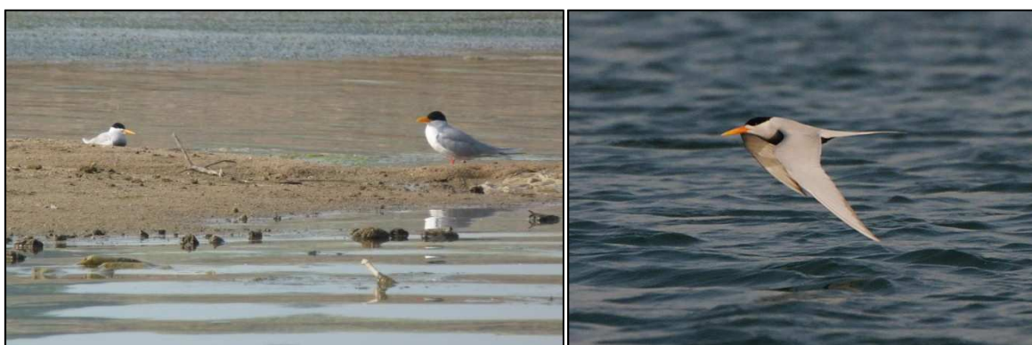
Black-bellied Tern & River Tern and Black-bellied Tern in flight, Chambal