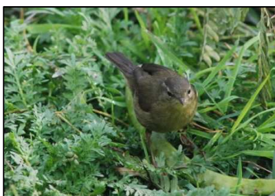
Smoky Warbler (ssp. weigoldi?)