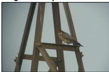
Red-necked Falcon, Chambal