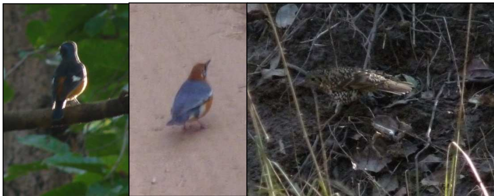
Documentation photos of the three exclusive thrushes seen in Kanha – Blue-capped Rock Thrush, Orange-headed Thrush and Scaly Thrush.