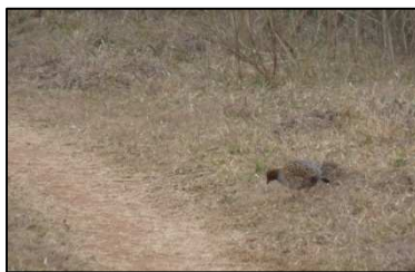
Painted Francolin, Panna