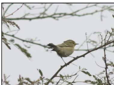
Brook's Leaf Warbler, Bhindawas