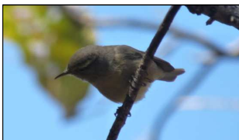
Sulphur-bellied Warbler, Bhimbetka