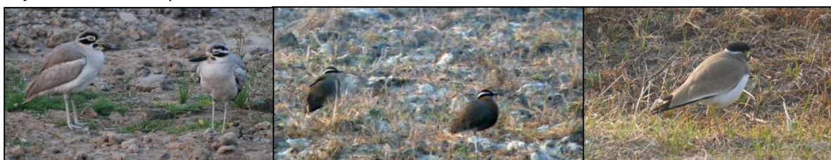
Great Thick-knee, Chambal