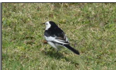
Ssp. leucopsis . Khajuraho

188. *White-browed Wagtail Motacilla madaraspatensis . 2/1 8 Chambal river (down-stream), 3/1 10 Chambal river (up-stream), 6/1 7 Panna Tiger Reserve, 2 Ken River Lodge (Panna Tiger Reserve), 7/1 1 Orchha, 17/1 2 Varanasi, 16-17/1 20+ Chambal river, 27/1 2 Bhindawas lake.