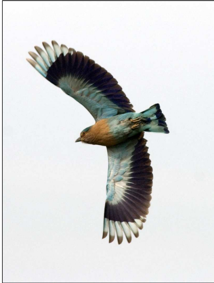
Indian Roller - the icon of traditional Indian farmland