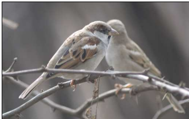
Ssp. parkini - larger - pale bill

*b. Ssp. parkini . 3/1 1 male near Chambal river, 27/1 1 male Dry flats S of Sultanpur Jheel, 15 (see photo) Bhindawas lake. Probably more widespread than our records indicates.