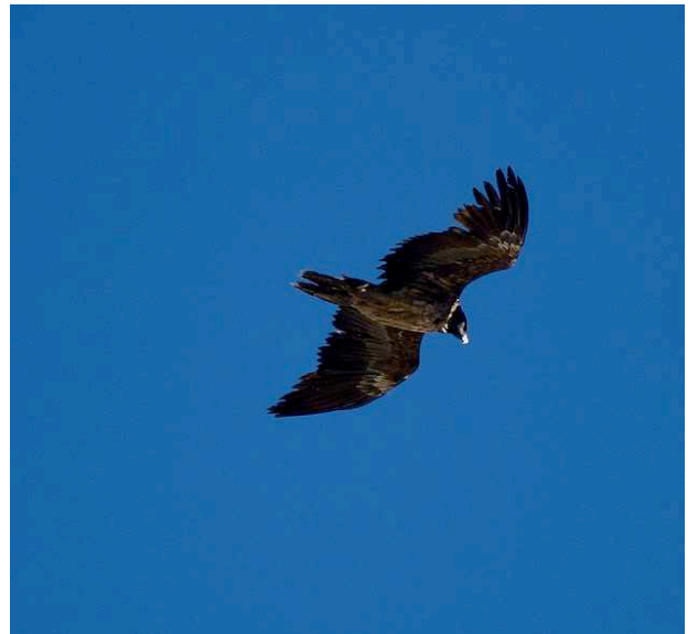
Ladakhi birds: Chukar (top), Golden Eagle (bottom left) and Lammergeier (bottom right).