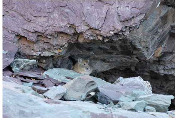
Left: Tibetan Argali Right: Presumed Large-eared Pika