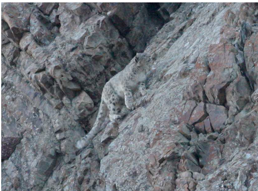
Snow Leopard focusing on potential prey