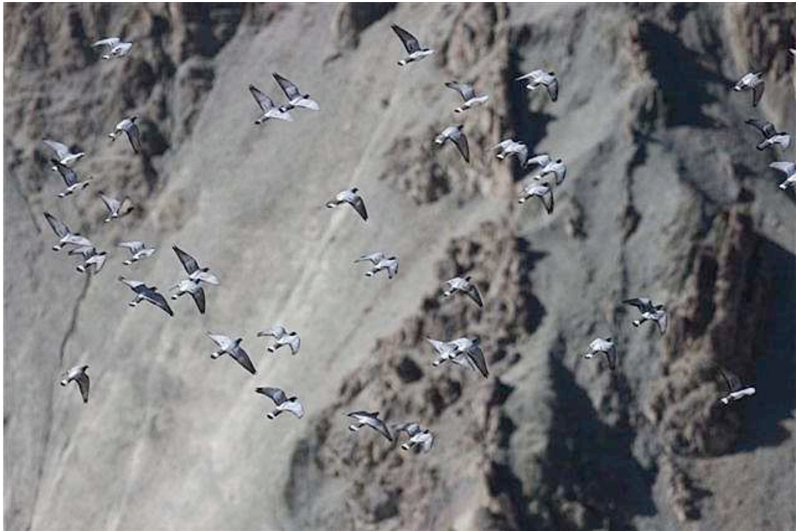
Hill Pigeons flying near Rumbak Village