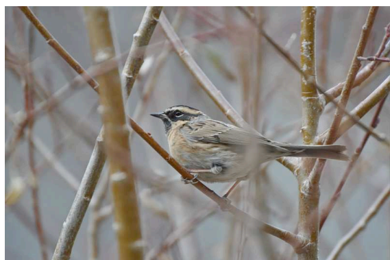
Accentors of Hemis NP: Robin Accentor (top,), Brown Accentor (lower left,) and Black-throated Accentor (lower right,).